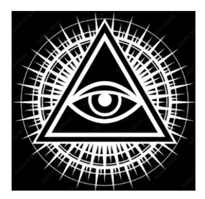
All Seeing Eye

In the beginning God created the heaven and the earth And the earth was without form and void And darkness was upon the face of the deep And the Spirit of God moved upon the face of the waters And God said 'Let there be light'; and there was light And God saw the light, that it was good And God divided the light from the darkness -Genesis